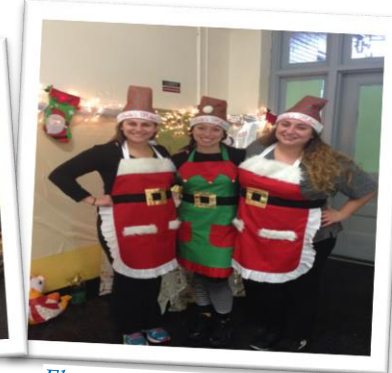
Elves at Christmas meal 12.25.2015