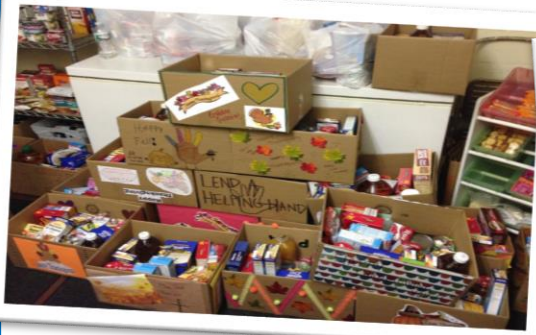
Thanksgiving baskets 2015