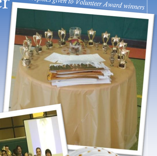
Trophies given to Volunteer Award winners

On Thursday April 21 st , 2016, more than 70 volunteers attended at the 2nd annual Volunteer Appreciation Dinner. The work of the meal kitchen and food pantry is possible because so many people from different churches, backgrounds, and organizations come together to give of their time, talent, and treasure. Without the volunteers Mary House would not exist. We are grateful for all of our volunteers and the work that they do to help God's people. Thank you!