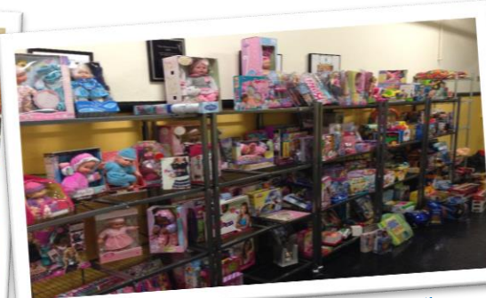
Toys given away during the Christmas season