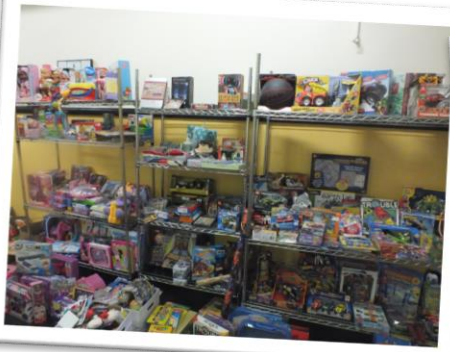
Toys given away this Christmas