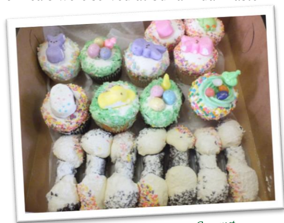
Pastries donated by Ron's Pastry Gourmet

Thanks to the generosity of St. Philip Church, Ron's Pastry Gourmet, St. Luke Church and the Blue Star Mothers, 110 meals were served at our annual Easter Brunch.