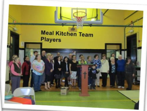
Volunteer Appreciation Dinner 4.14.2015

“As disciples of Christ, how can we not be concerned for the needs of the weakest?”—Pope Francis